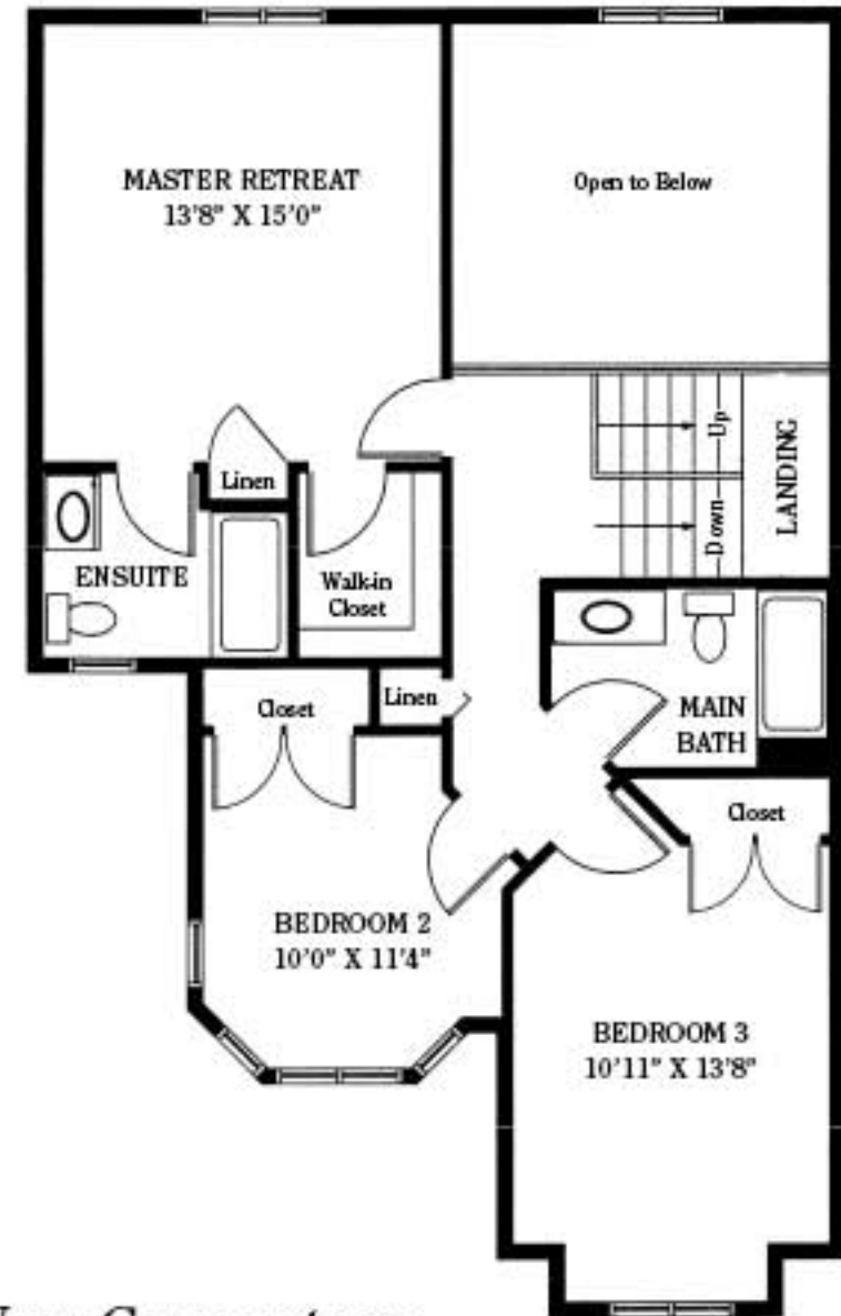
The New Cornerstone 2nd floor plan - 801 sq. ft. gross floor area